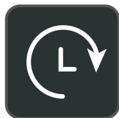
Ultra-long Battery Life