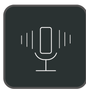
6 Mic for Superior Voice Pickup