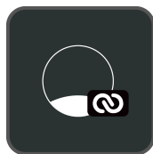
Flexible Daisy Chain