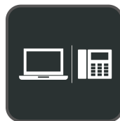
Multi-leading UC Platforms Compatibility