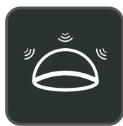
AI Noise Cancellation

The SP96 integrates 6 microphones and a 65mm speaker, utilizing advanced microphone technology and AI noise reduction to accurately pick up sound from any angle during calls, filtering out ambient noise and transmitting clear human voices. Combined with virtual bass technology, it enriches playback sound quality, delivering a premium audio experience. With an integrated liquid crystal display, it showcases a high-end appearance while intuitively displaying device status. Flexible cascade operation enables multiple devices to connect wirelessly, ensuring everyone in the meeting room can hear clearly. Its long battery life ensures prolonged participation and usage, and its multi-platform compatibility allows seamless use in work environments, providing users with a clear, immersive audio experience.